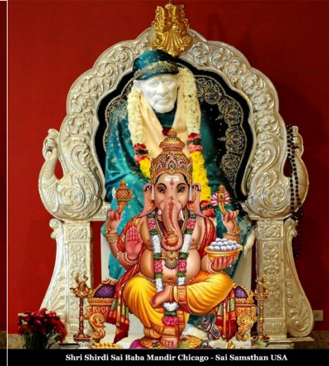
Shri Shirdi Sai Baba Mandir Chicago - Sai Samsthan USA